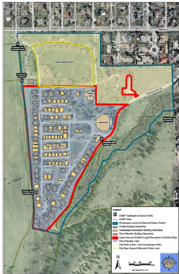
Figure 1: CCA Leasehold (outlined in red)

Place management: the process of preserving or enhancing an area in a manner that maintains its integrity as a “place” with a unique character and function. This is practiced through programs to enhance a location or to maintain an already attained desired standard of operation. Place management can be undertaken by private, public or voluntary organizations or a mixture of each. Despite the wide variety of place management initiatives, the underlying common factor is usually to best meet the needs of multiple users and interests (e.g., residents, visitors, and owners) in a manner consistent with the nature of the place.